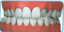
CROSSBITE Upper and lower jaws are misaligned.