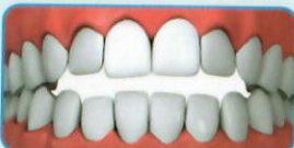
OPEN BITE Vertical spacing between the front teeth.

Ask your doctor how Invisalign clear aligners can work for you. Find out today.