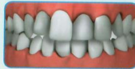
CROWDING Not enough room for the teeth.

Many people incorrectly believe that Invisalign clear aligners are only effective in treating minor teeth straightening issues. But the fact is, Invisalign clear aligners have proven to be effective in treating moderate and severe conditions, including the following: