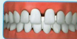
SPACING Gaps between the teeth.