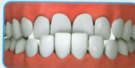
UNDERBITE Protruding lower teeth.