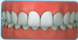
OVERBITE Protruding upper teeth.